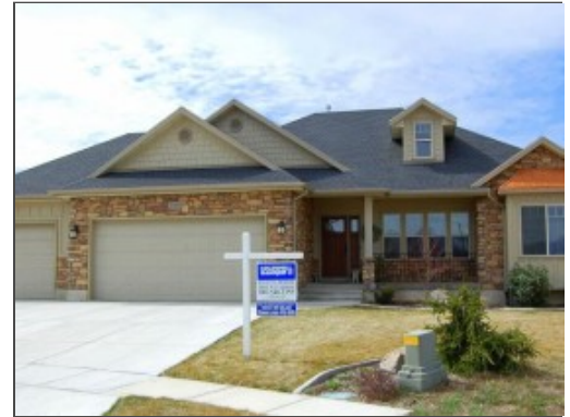
Jr High: Sand Ridge Other Schl:

Tour/Open: Tour Status: Active List Date: 04/06/2010 Area: Hooper; Roy Restrictions: No Taxes: $2,088 HOA Fee: $0 HOA Phone: Pre-Market: