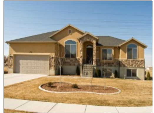
Jr High: Sand Ridge Other Schl:

List Price: $254,900 Price Per: $81.28 CDOM: 60 DOM: 60 Address: 4767 S 3200 W NS/EW: 4767 S / 3200 W City: Roy, UT 84067 County: Weber Proj/Subdiv: Tax ID: 08-442-0009 Zoning: RES HOA Contact: HOA Remarks: Tour/Open: Tour Status: Active List Date: 02/18/2010 Area: Hooper; Roy Restrictions: No Taxes: $1,786 HOA Fee: $0 HOA Phone: Pre-Market: