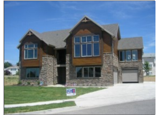
Jr High: Sand Ridge Other Schl:

List Price: $435,000 Tour/Open: Tour Price Per: $122.29 Status: Active CDOM: 264 List Date: 02/18/2010 DOM: 60 Address: 4024 S 2225 W NS/EW: 4024 S / 2225 W Area: Hooper; Roy City: Roy, UT 84067 County: Weber Restrictions: No Proj/Subdiv: ROYAL VIEW Taxes: $1,026 Tax ID: 08-322-0005 HOA Fee: $0 Zoning: HOA Contact: HOA Remarks: Pre-Market: