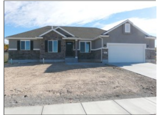
Jr High: Roy Other Schl:

List Price: $269,500 Tour/Open: Tour Price Per: $87.33 Status: Active CDOM: 151 List Date: 11/19/2009 DOM: 151 Address: 5662 S 3150 W NS/EW: 5662 S / 3150 W Area: Hooper; Roy City: Roy, UT 84067 County: Weber Restrictions: No Proj/Subdiv: WHISPERING MDWS 10 Tax ID: 09-558-0010 Taxes: $1 Zoning: R-1 HOA Fee: $20 HOA Contact: HOA Phone: HOA Remarks: Pre-Market: